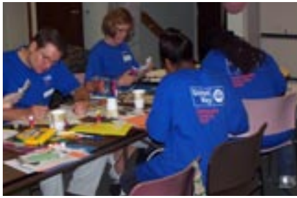
Corporate Volunteers at Book Folder event in the downtown office